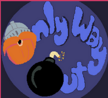
Only Way Out