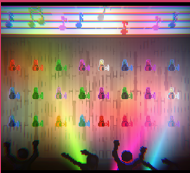
Mandrake Soul Orchestra